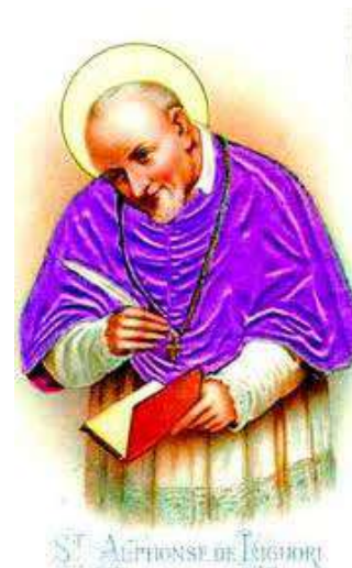
St Alphonsus of Liguori.