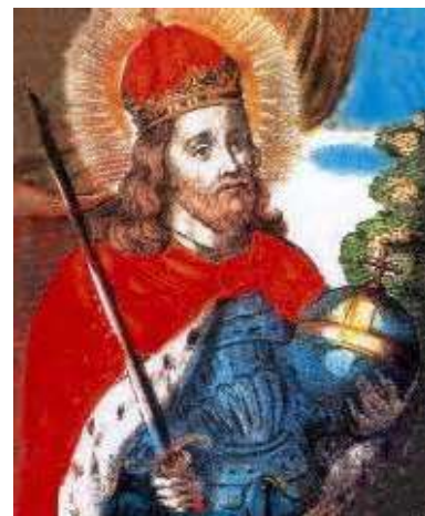
St Henry II.

A Retrouvaille/Rediscovery program for couples experiencing marital difficulties will be held July 21st through 23rd at the Lumen Christi Retreat Center, in Schriever (near Houma), hosted by the New Orleans community. Retrouvaille is a program sponsored by the Roman Catholic Church that applies to couples living either separated, divorced, or disconnected lives who want to save their marriage. The program consists of a week-end followed by six follow-up sessions along with a monthly support group. For information and/or registration, contact (985)641-3802.