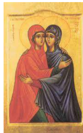
The Visitation of the Blessed Virgin Mary.