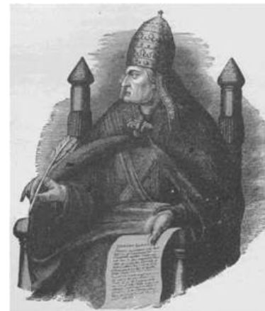
Pope St Gregory VII.

The Solemnity of the Ascension of the Lord is transferred to next Sunday, May 28th.