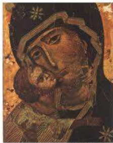
Our Lady of Vladimir