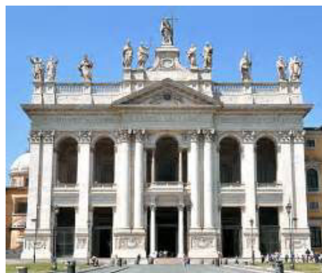
Papal Archbasilica of St John in Lateran.